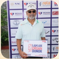
Mani Rathnam Director