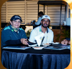
Golfer Enjoying the evening party