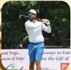
Murali Vijay Cricketer